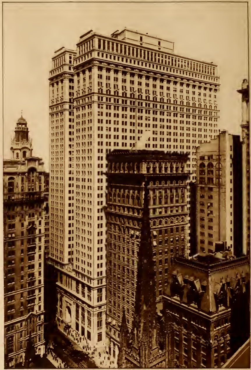
EQUITABLE BUILDING, covering entire square block on Broadway and Cedar Street. Thirty-eight stories high and has 15,000 workers in its offices.